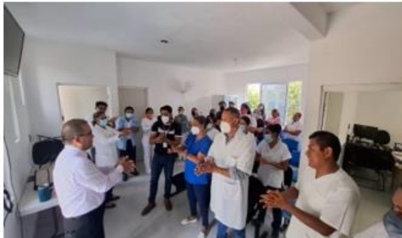
Capacitación a personal de salud, sobre la Técnica de "Higiene de Manos"