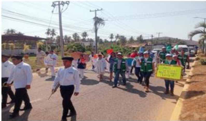
Desfile alusivo a la conmemoración de "Higiene de Manos"