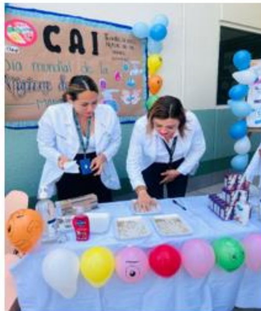
Actividad Lúdica “ Manos limpias manos felices ”

Los Establecimientos de Atención Médica de las Dependencias del Sector Salud del Estado de Guerrero: ISSSTE, SEDENA, SEMAR, IMSS ORDINARIO E IMSS BIENESTAR, participaron activamente como cada año en conmemoración al 5 de mayo: “ Día Mundial de la Higiene de Manos ” con diversas actividades de difusión: como son desfiles, capacitaciones, conferencias, simposios, periódicos murales, videos y spots, siendo este año el lema: “ Guantes a veces, Higiene de Manos Siempre ”, todo ello como una medida para concientizar que la higiene de manos es crucial para prevenir y reducir el riesgo de contraer enfermedades y con ello se evita la transmisión de patógenos a otras personas, especialmente en entornos de atención médica.